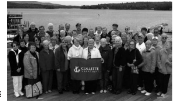
Getting ready to board the ferry.

From there the drive up through the White Mountains and picturesque villages was a portrait of color as the fall leaves were at their peak during our stay.