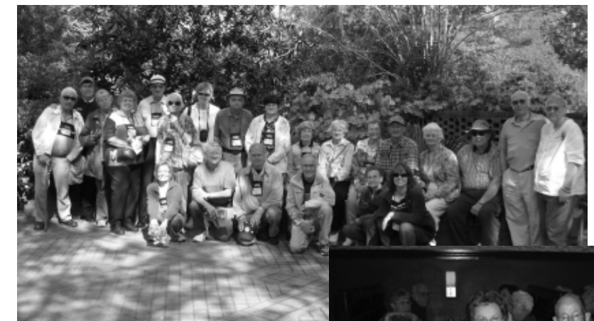
Brooke Green Gardens, South Carolina

Then we were off to Charleston, SC and Savannah where we found the stately historic