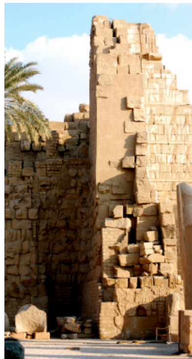
Cover photograph: Along the Nile